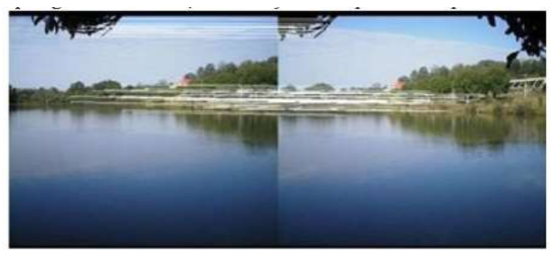
Fig.2 Images after execution of RANSAC

produces a reasonable result only with a certain probability, with this probability increasing as more iterations are allowed. The algorithm was first published by Fischler and Bolles. RANSAC algorithm is used for fitting of models in presence of many available data outliners in a robust manner. Given afitting problem with parameters considering the following assumptions.